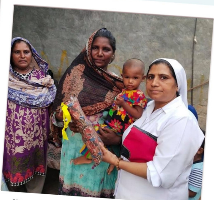
We make Days for Girls Menstrual Hygiene kits and include a bra for the girls and women at the same time. Pakistan

We send them to Pakistan & the Philippines