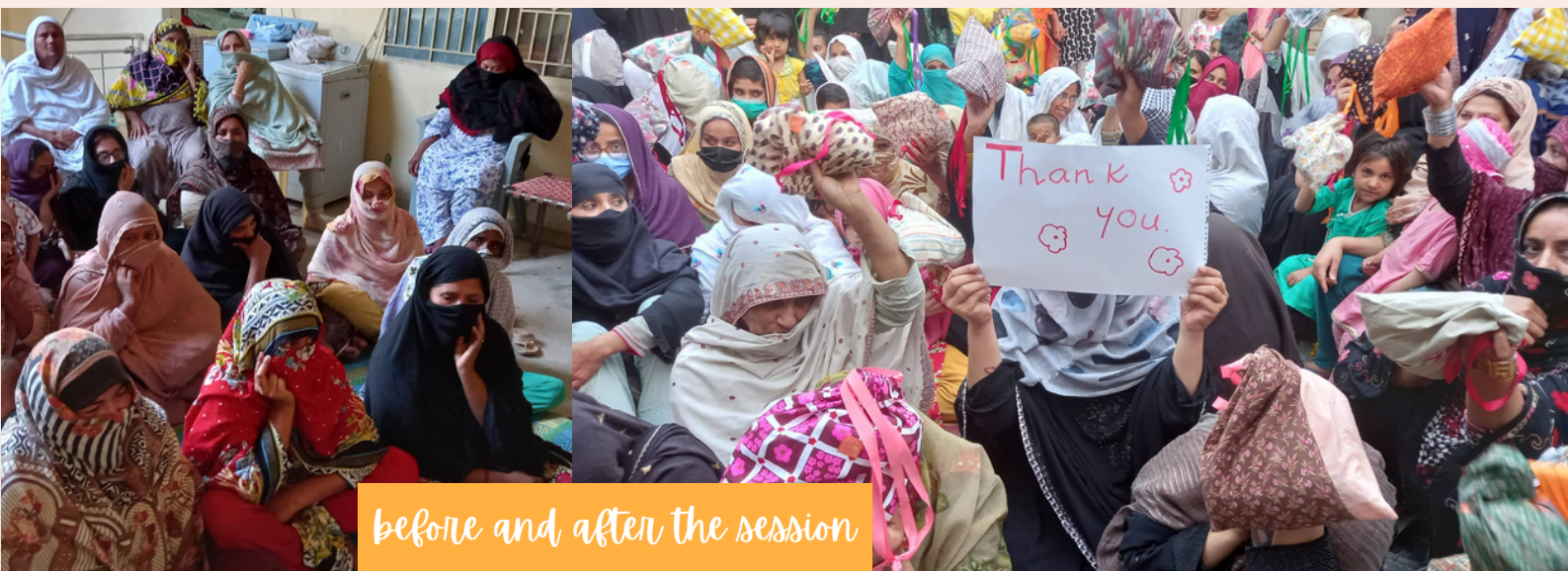
before and after the session