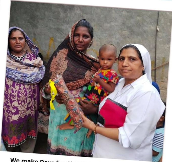
We make Days for Girls Menstrual Hygiene kits and include a bra for the girls and women at the same time. Pakistan

Bras are very much a luxury in poorer rural communities, and often women don't have even one bra to use. Bras certainly are one of the most consistent items we are asked for. And they are so appreciated.